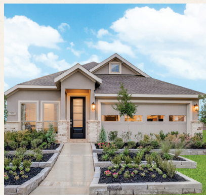
4. VILLAGE BUILDERS 45' homesites | 1,600-2,540 sq. ft.