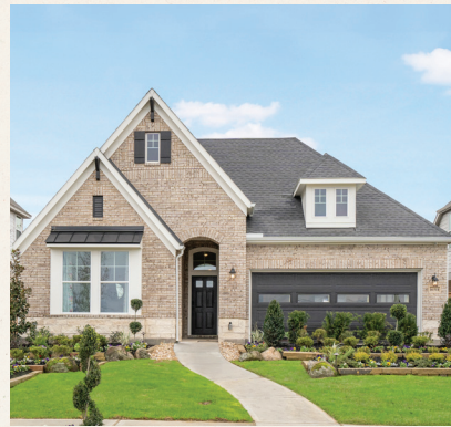
1. DAVID WEEKLEY HOMES 40' & 50' homesites | 1,450-3,070 sq. ft.

Make your picture-perfect home a reality.