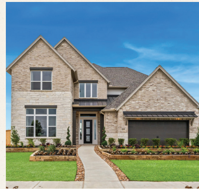
3. SITTERLE HOMES 60' homesites | 2,490-3,680 sq. ft.