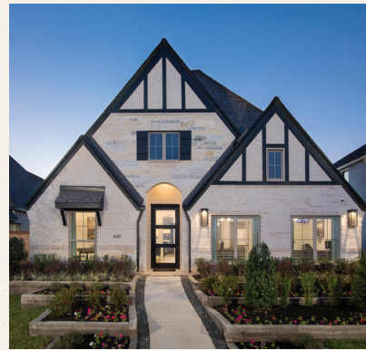
2. PERRY HOMES 40' & 50' homesites | 1,500-3,300 sq. ft.