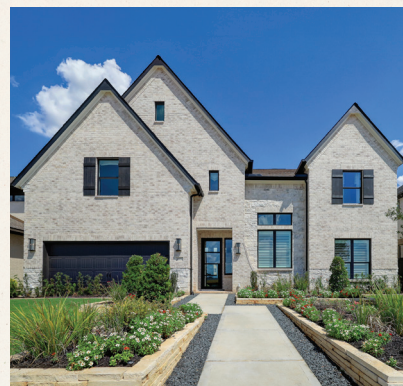
5. WESTIN HOMES 45' & 60' homesites | 2,490-3,800 sq. ft.